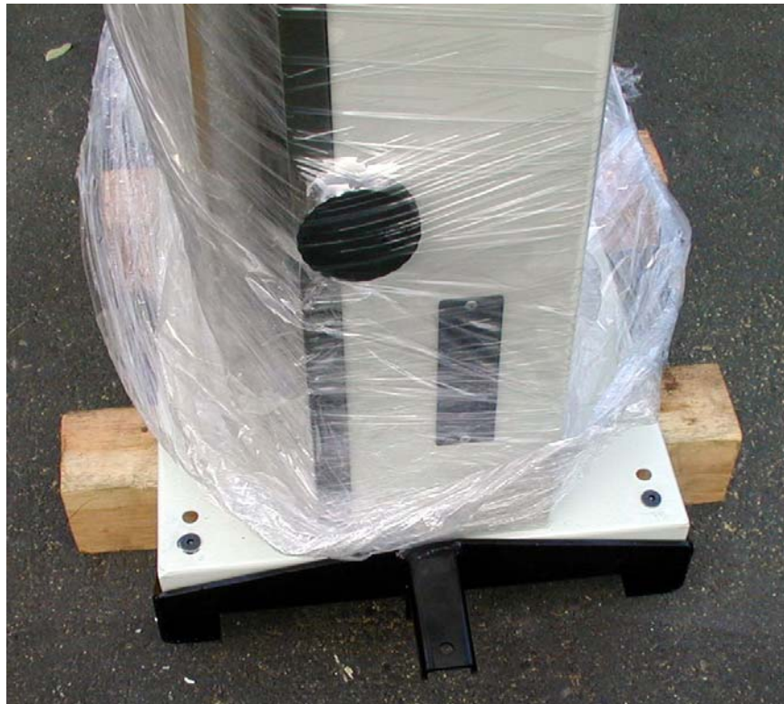
Front bracket fitted.

NOTE: the number of tapped holes may vary depending on the bracket supplied.