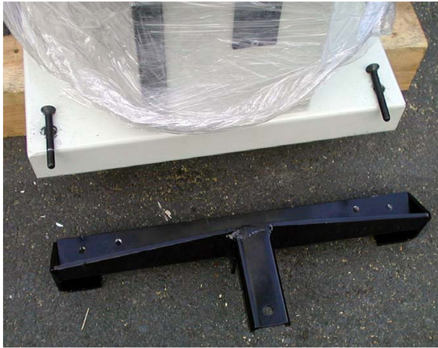
View of front bracket with fitting screws.

NOTE: the number of tapped holes may vary depending on the bracket supplied.