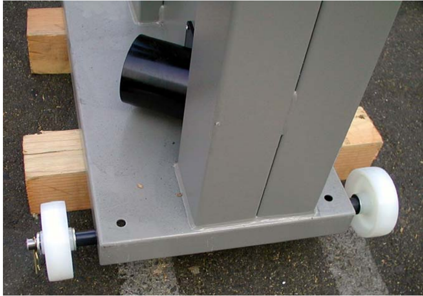
Back wheel assembly completed.