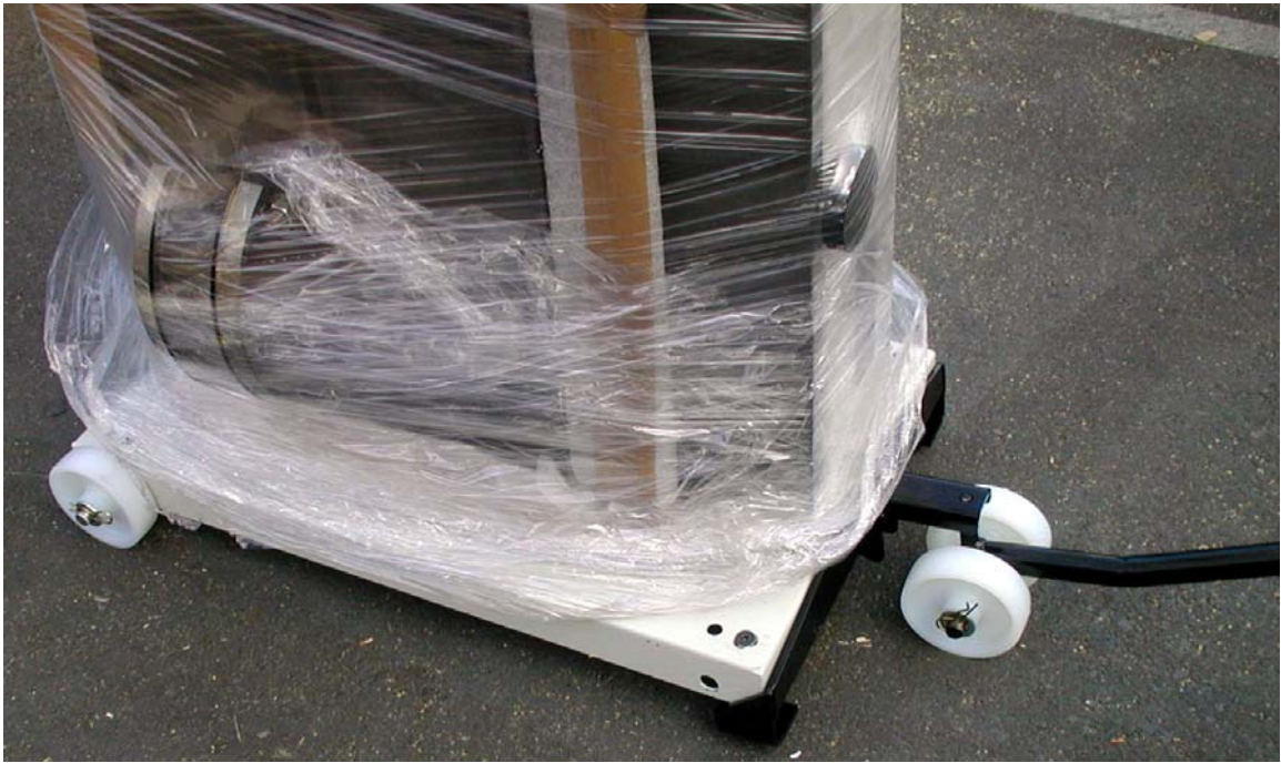
Completed assembly with mobility handle in transport position.