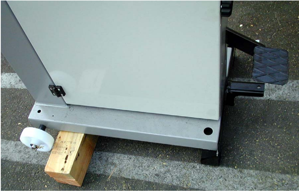
Front bracket fitted with front block removed.