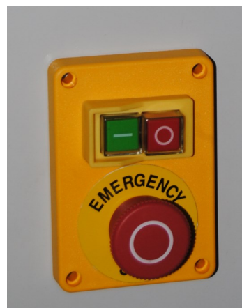
Front mounted emergency stop