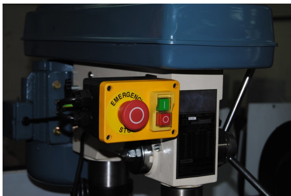
Side mounted emergency stop