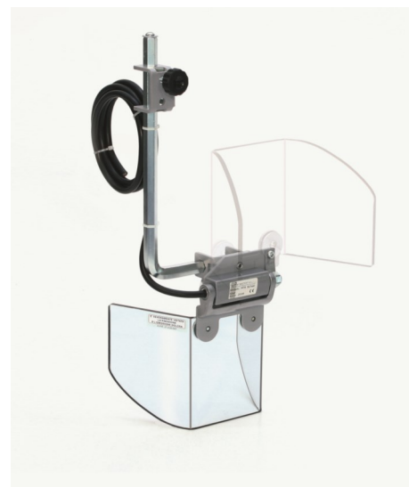
Optional chuck guard with micro switch lock out