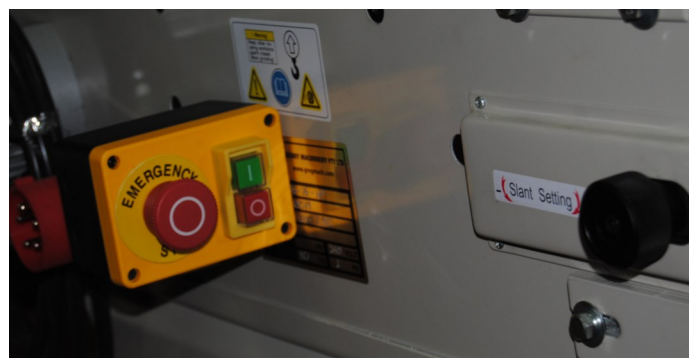
Side mounted emergency stop