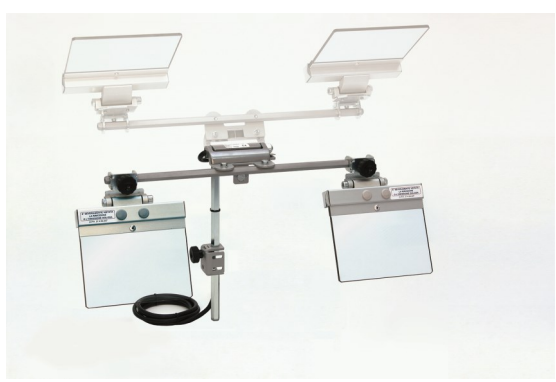
Optional guarding with micro switch lock out