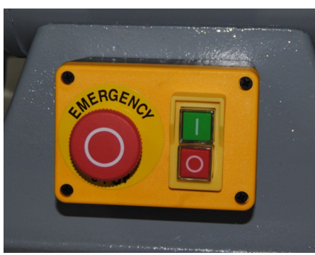
Front mounted emergency stop