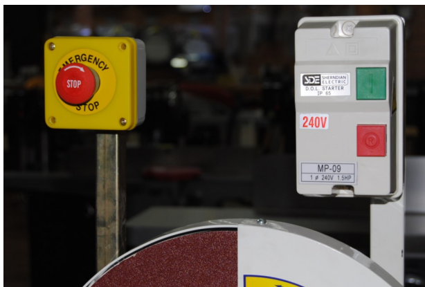
Front mounted emergency stop