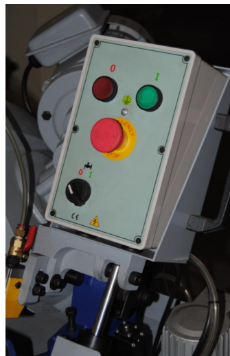
Front mounted emergency stop