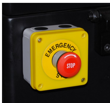
Rear mounted emergency stop