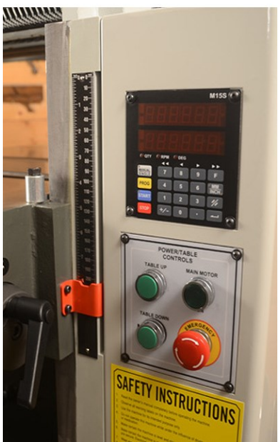
Front mounted emergency stop