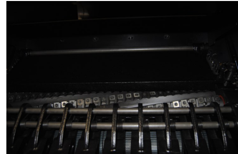
Helical cutter block significantly reduces noise in classroom