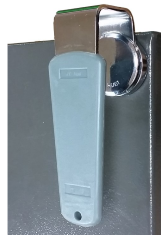
Door covers come with manual locking lever and micro switch cut out