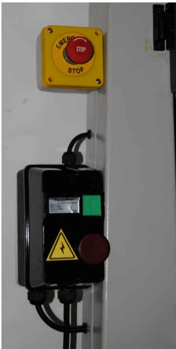
Side mounted emergency stop