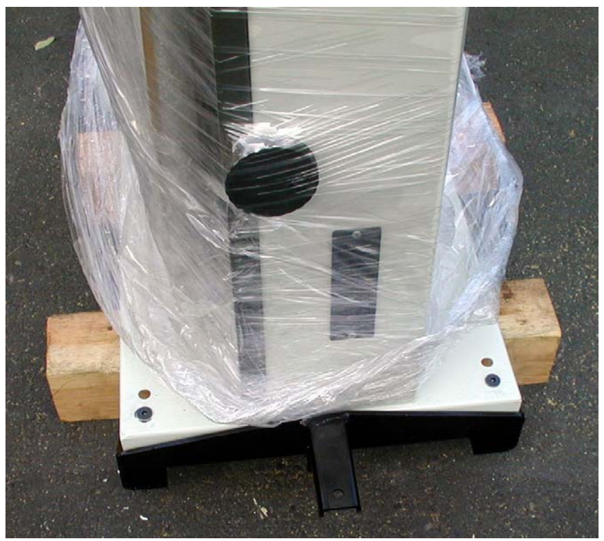
Front bracket fitted.

View of front bracket with fitting screws. NOTE: the number of tapped holes may vary depending on the bracket supplied.