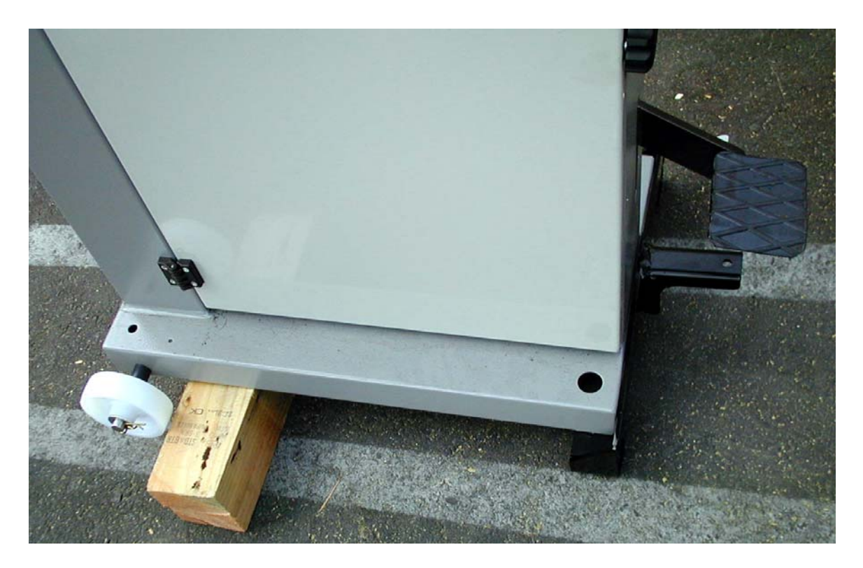
Front bracket fitted with front block removed.