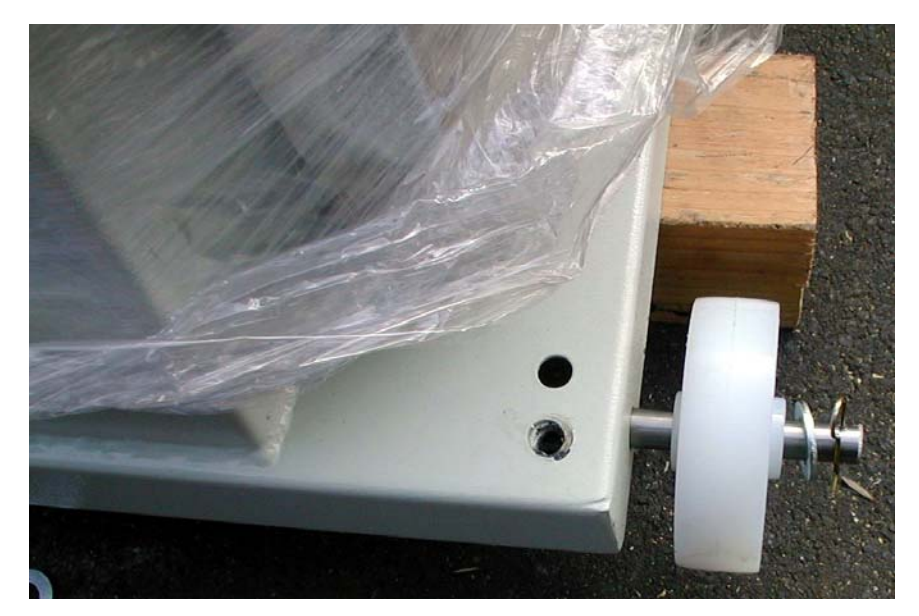
Rest the band saw on 2"x4" wood or similar. Fit the shaft through the base of the band saw. Fit wheels, washers and split pins as shown. Discard extra washers and spacers, as they are only required if fitting the shaft to the 16" Basic/SEC band saws.