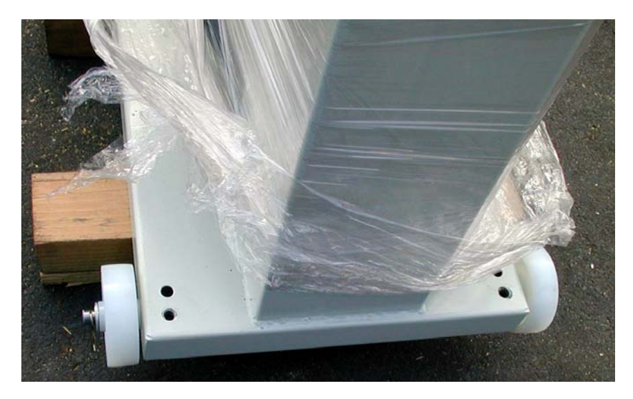
Completed rear shaft assembly.